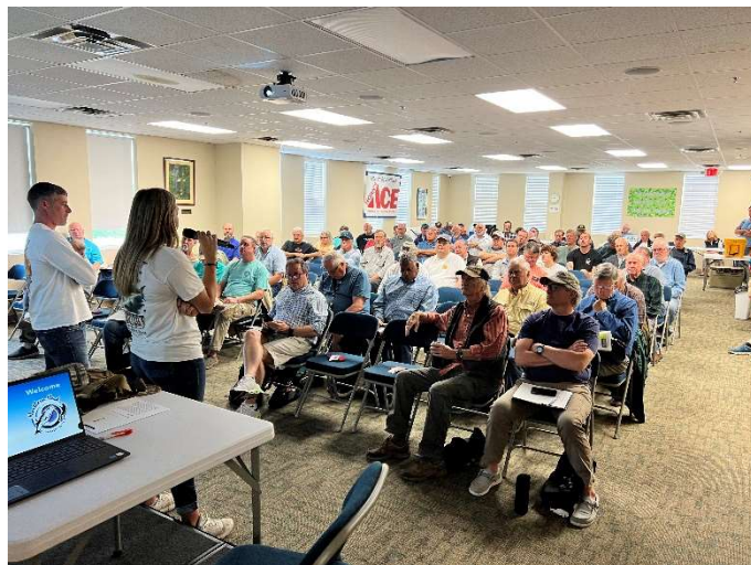
NNK Saltwater Shootout Tournament Butler's Bait & Tackle

Reefs, wrecks, obstructions, and other structures for recreational fishermen