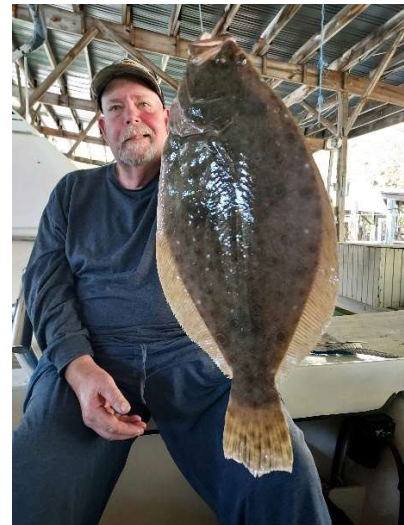
Little Wicomico Jetty Live minnow