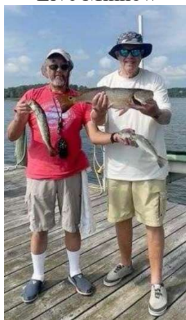
Great Wicomico MirrOlures