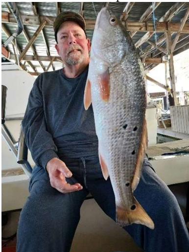
Little Wicomico Jetty Live Minnow