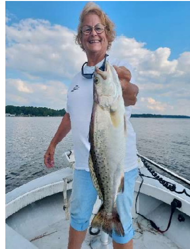
Piankatank River MirrOlure