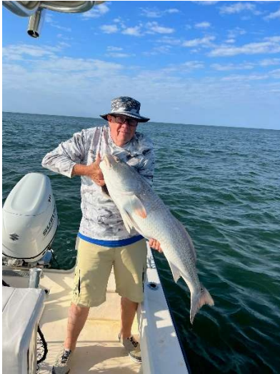
Tangier Bay Live Spot