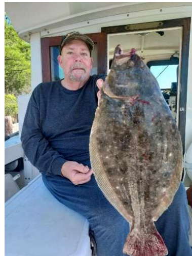
Little Wicomico Jetty Live Minnow