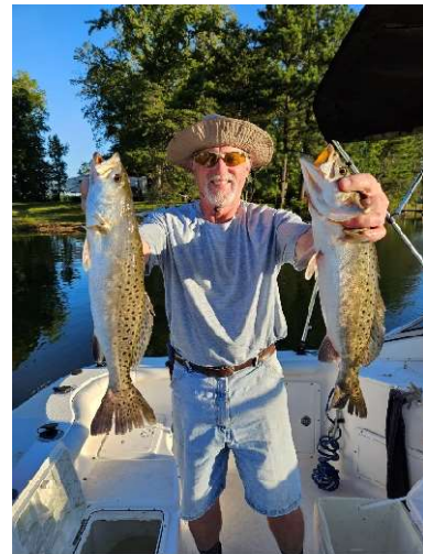
Great Wicomico Soft Plastics/Live Shrimp