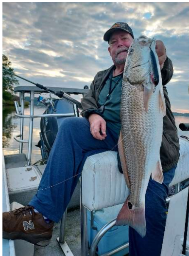
Piankatank River Topwater Plug