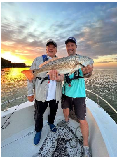
Great Wicomico Soft plastic on a Jig

The water temperature is slowly cooling, and it will get better. If you're not sure that it's a good time to be fishing for all species, just look at what some of our members caught recently. All these fish were taken in the middle to lower bay or tributary rivers.